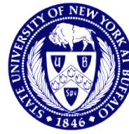
State University of New York – Buffalo