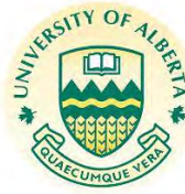
University of Alberta