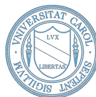
University of North Carolina – Chapel Hill