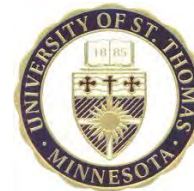
St. Thomas University