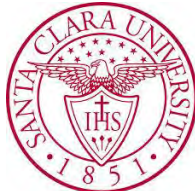
Santa Clara University