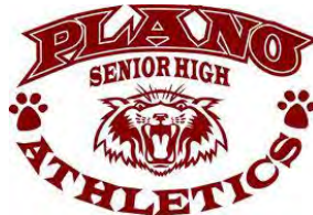
Plano Senior High School