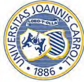
John Carroll University