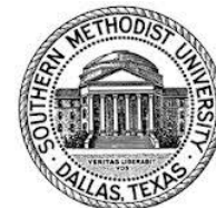
Southern Methodist University