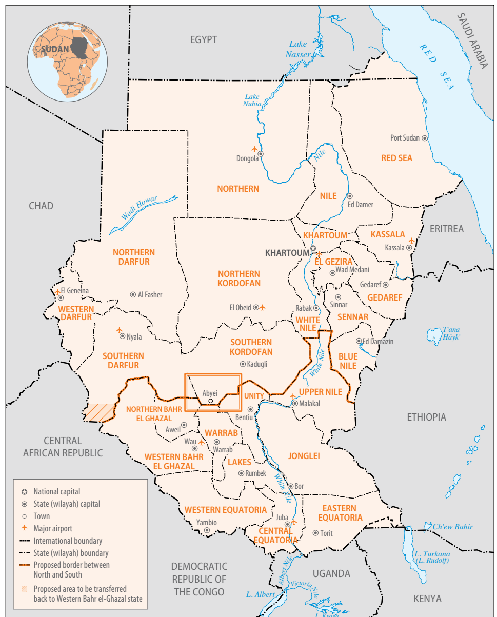
The boundaries and names shown and the designations used on this map do not imply official endorsement or acceptance by the United Nations.

See map on the following page for more detail on the highlighted box below.