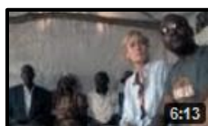
Robin Wright in Congo