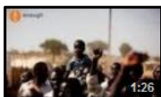
This is the Enough Project.

Check out some of our videos and show them at your event to educate and entertain your guests: