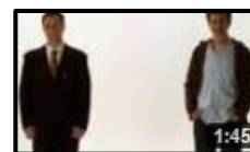
I'm a Mac... and I've Got a Dirty Secret

*Find more by visiting Enough's YouTube channel