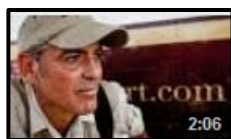
George Clooney: Endgame in Sudan