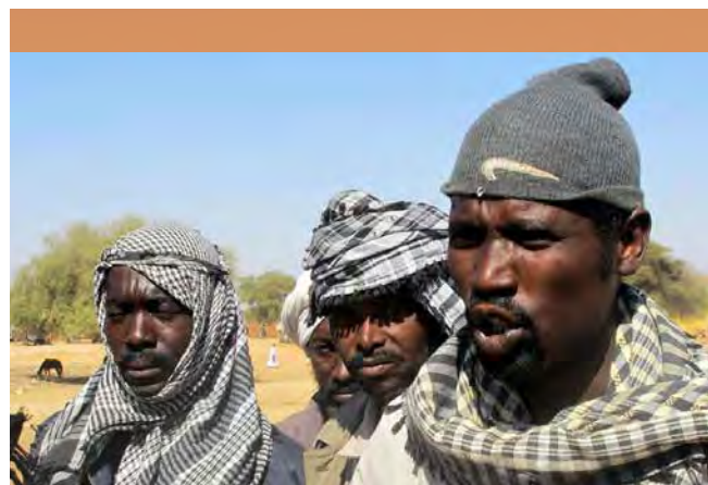
A miner explains the incident that took place gold mines, explaining that it forced thousands of mine workers to seek refuge in neighboring villages.

South Sudan's January 2012 decision to cease its 350,000 barrel-per-day oil production has exacerbated these dire economic straits. 20 The 14-month standoff with South Sudan deprived the Sudanese government of millions of dollars in transit fees and contributed to a climate of uncertainty. 21 Both sides are engaged in dangerous brinkmanship, with each side waiting for the other's collapse. 22 Although the two Sudans signed an agreement to facilitate the restart of oil exports in August 2012, implementation began in early April 2013: six months behind schedule. 23 In the meantime, the government of Sudan was forced to buy crude oil at higher than market prices to keep its refineries operating. 24 These deals weaken Sudan's economy but enrich the middlemen within Sudan's government, who view each transaction as an opportunity for personal financial gain. When compounded, these economic pressures have placed an unprecedented strain on the ruling party's political authority and control, catalyzing a survivalist reaction from the regime.