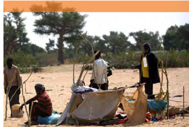
Miners take refuge in Saraf Omra, North Darfur, after fleeing the gold mines in the Jebel 'Amer.

The Abbala militias' violent power play to consolidate control over North Darfur's gold mines demands greater attention and a coordinated response from the international community. This report offers six recommendations for a comprehensive solution to address not only the recent waves of violence in Darfur, but also the root causes of the conflicts plaguing the country. Among other things, avoiding another reprise of state-sponsored atrocity will require confronting the governance problems crippling Sudan, supporting inter-communal reconciliation efforts, bridging the gap in justice and accountability for Darfur's victims, guaranteeing humanitarian access to Darfur's conflict-affected regions, promoting sustainable economic development in the region and pushing for greater scrutiny of supply chains to prevent the government of Sudan from benefitting from trade in what should be considered and labeled "conflict gold."