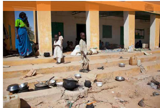
Displaced persons take shelter in a public building in El Sireaf, North Darfur, after fleeing Jebel 'Amer.

During the late February wave of attacks, hundreds of armed Abbala militiamen attacked al-Sref Beni Hussein, where over 60,000 displaced people had sought refuge in the aftermath of the first wave of attacks. Internally displaced people interviewed by Amnesty International shared that armed men arrived on 150 camels and 200 horses and in more than 40 four-wheel drive vehicles to attack the town. 97 Fifty-three people were killed and 66 injured during the late February attack, most of whom were civilians, including women and children. 98 Attackers also burned down houses and other civilian buildings in al-Sref. Witnesses report that when they fought back with Kalashnikovs, they were able to kill 17 of the attackers, most of whom carried government issued identity documents identifying them as members of the Border Guard. 99