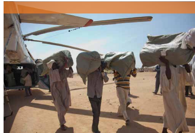
In January 2013, UNAMID delivered more than 44,000 kilograms of urgent humanitarian aid, by land and air, to thousands of civilians who were displaced in the North Darfur villages of Saraf Omra, Kabkabya, El Sereif and Abu Gamra.

Urgency to replace easy revenue streams from southern oil, which dramatically dried up following South Sudan's independence in 2011, has accelerated the Sudanese govern-