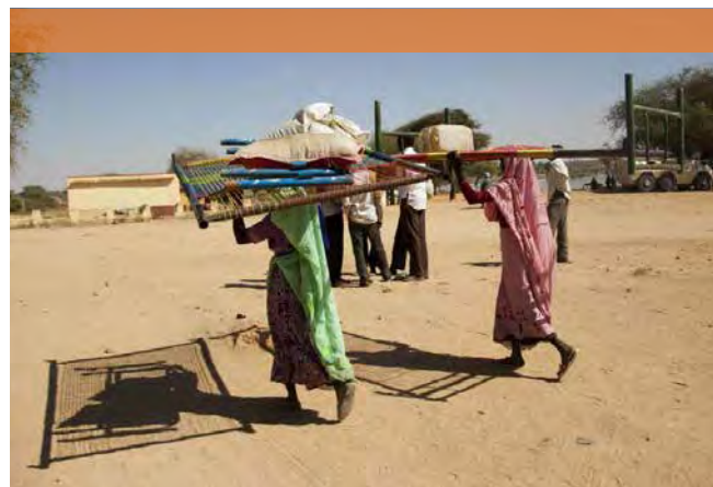
Women displaced by fighting in Jebel 'Amer carry their possessions on their heads in El Sereif, North Darfur.